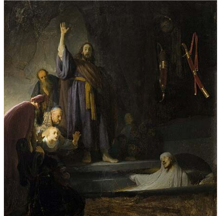
“The Raising of Lazarus,” by Rembrandt 1630-1632