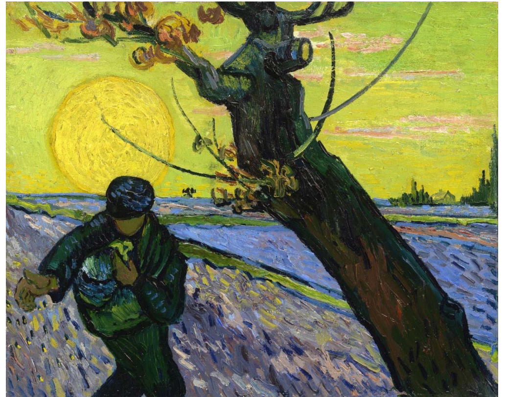
“The Sower III,” by Vincent Van Gogh