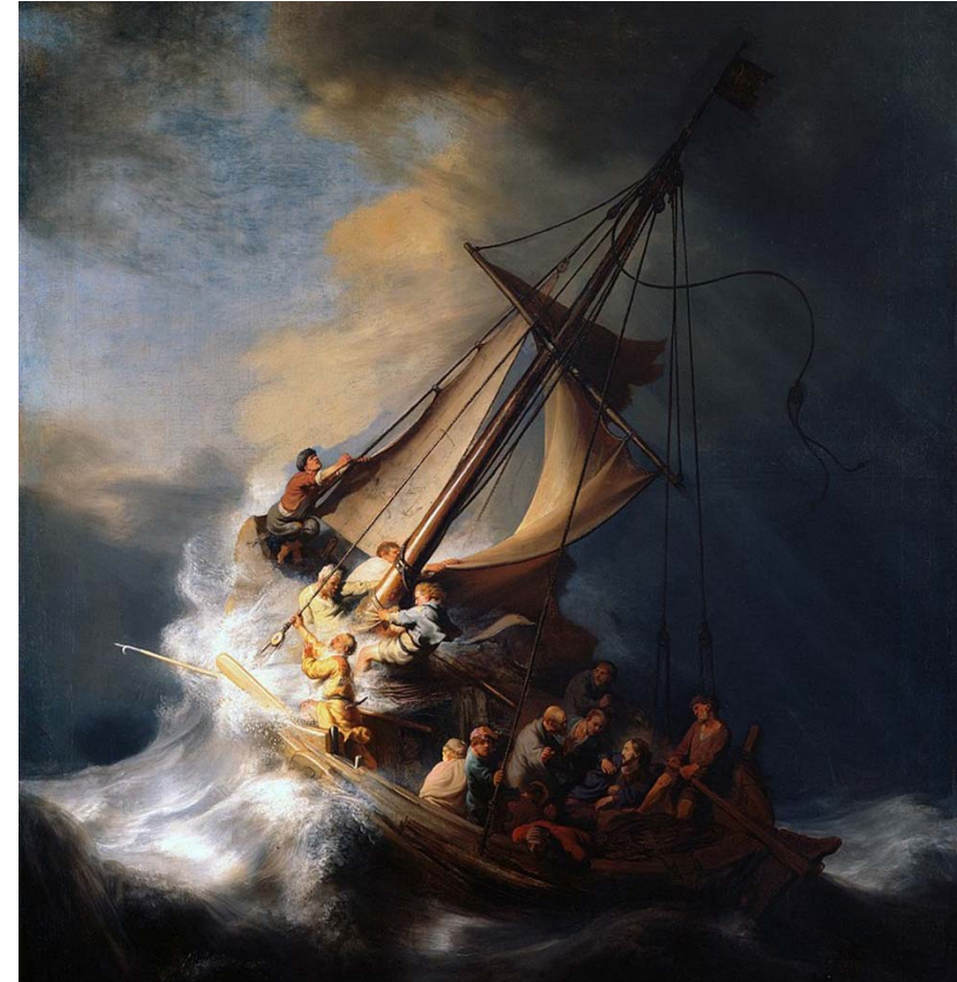
“Storm on the Sea of Galilee,” by Rembrandt